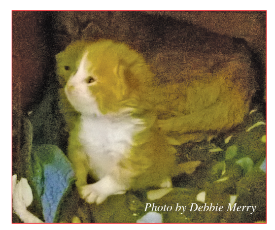
Twelve Days Old and Counting: One of the surviving kittens from our first litter of the year. Feral kittens face long odds, even with the helping hands of experienced caregivers.

hours prior to the client's finding them and placing them in a box by her front door. Mom showed up, entered the box with the kittens and began nursing them. All seemed fine, except for the fact that neither